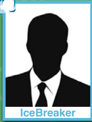
9. Alfred Uipa Auckland, NZ